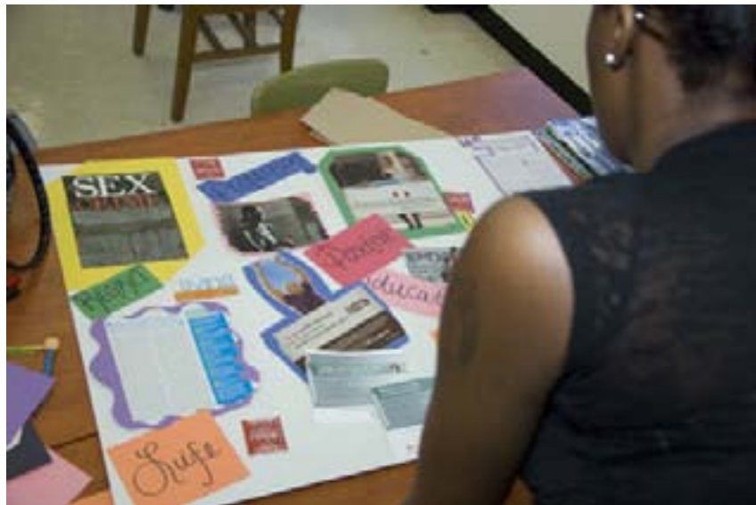
Students from North Carolina Central University created posters which were displayed at the Hayti Heritage Center during the World AIDS Day celebration.